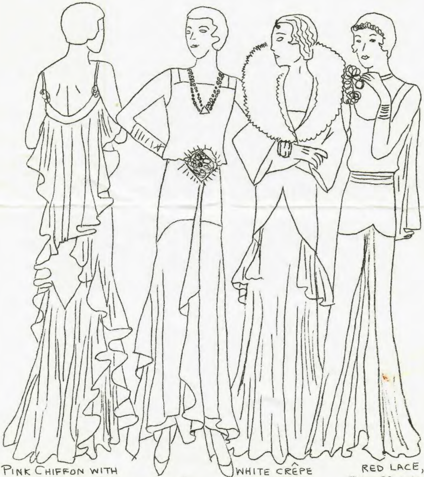
PINK CHIFFON WITH RHINESTONE CLIPS